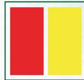
Twin Pot 鸳鸯锅