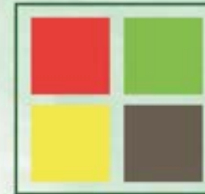
Quart Pot 四季锅