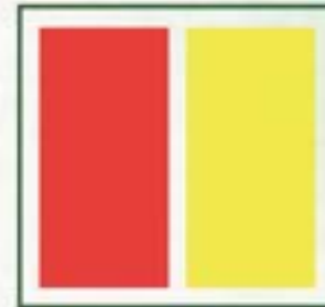
Twin Pot 鸳鸯锅